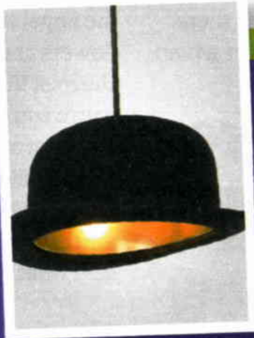
Jeeves Pendant Light – The French Bedroom Company £150

The British love eccentrics and doing things their own way in the home, garden – even with the food we eat. So we've chosen some products that we've come to love down through the years – with a bit of an eccentric twist, of course!