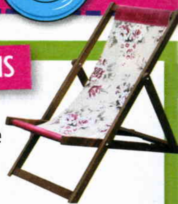
Hardwood British Deckchair – Berry Red £125

Soak up the sun in your deckchair, get passionate about your passiflora, or enjoy a game of skittles with your ice-cool beer