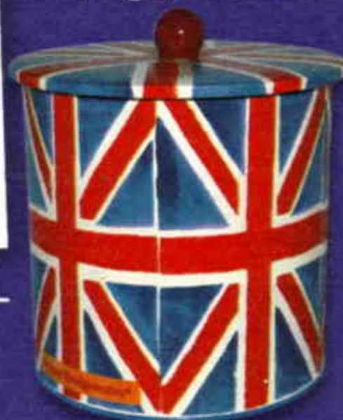
Union Jack Biscuit Barrel – Emma Bridgewater £13