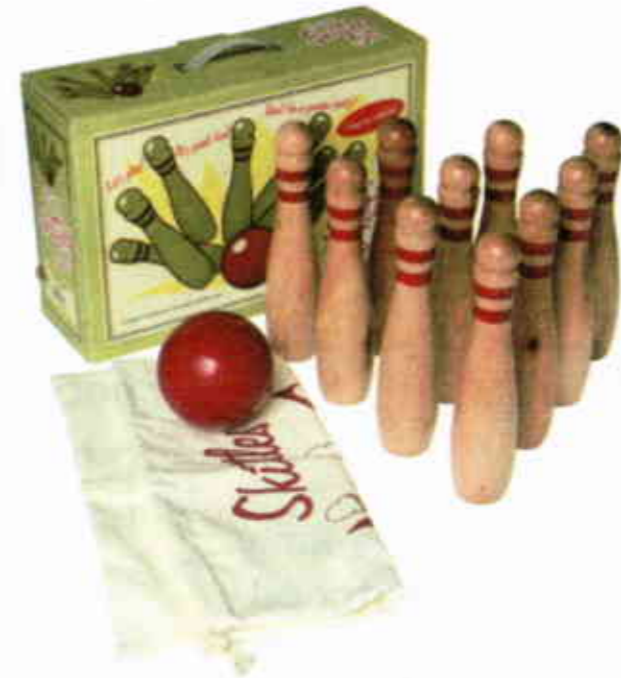
Wooden Skittles – Dotcomgiftshop £39.95