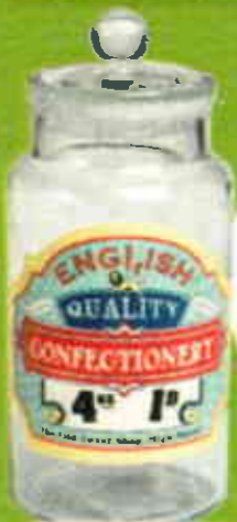
Glass Jar English Confectionery – Dotcomgiftshop £6.95

Enjoy afternoon tea and cakes on a classy and feminine stand and tea served in a pretty teapot, cup and saucer. And if you have an even sweeter tooth, why not fill this jar with your fave hard boiled delights, or perhaps a Bon Bon or two?